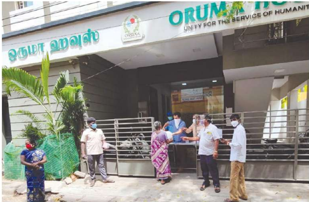
COVID Activities during Second Lock Down