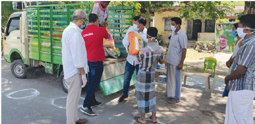
COVID Activities during First Lock Down